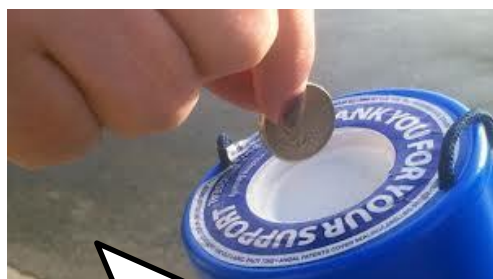
Shoppers bag £410 for charity! Staff and customers at Tesco in Cupar raised £410 for Home-Start East Fife.