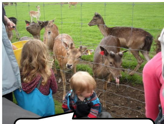
Summer Outing Cupar Deer Centre 12 th June 2013.