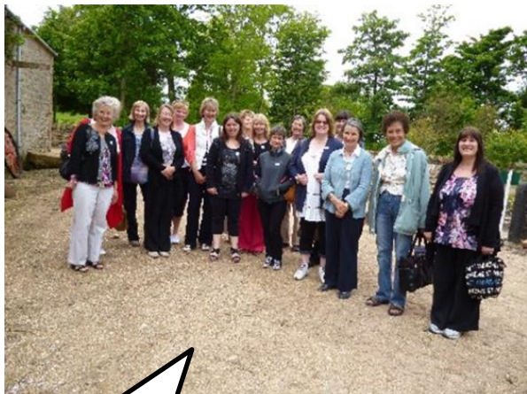
Volunteers Week 1-7 June 2013 Cambo Treat for Volunteers.