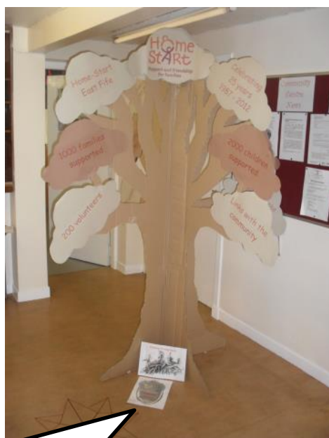
Marking 25 years of helping children AGM 11 th September 2013 'From small acorns, great oaks shall grow'