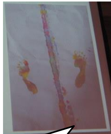
On Your Marks! Winning entry for MUSA's Young Artist Award 2014, inspired by Commonwealth Games in Glasgow.