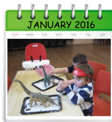
Dinosaurs and Gloop!