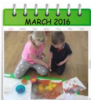
Experimenting with colour!