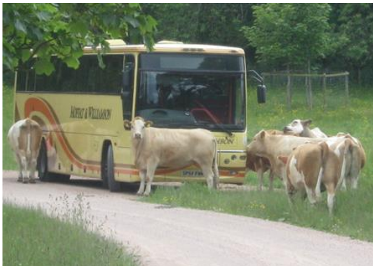
Cows trying to hitch a ride!

Can you imagine our surprise when we returned to the coach to see the Cambo cows surrounding it - but there was no room for them on board with all the sleepy children so reluctantly they moooved off!