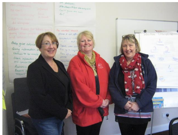
Annabelle Ewing, MSP, Member for Mid Scotland and Fife visited Monday 9 th November 2015