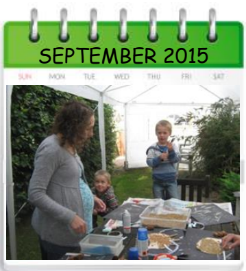
Harvest rubbings hedgehogs etc.