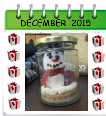
Christmas crafts Hot Chocolate Marshmallow Snowmen