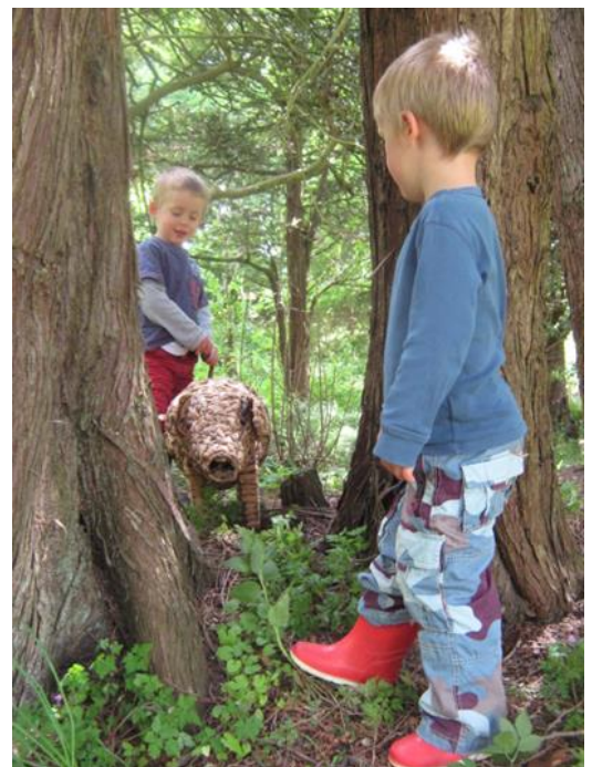
Meeting the Wild Willow Pigs!