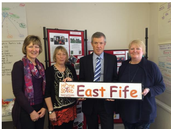
Willie Rennie, MSP, Member for Mid Scotland and Fife visited us on Monday 5 th October 2015