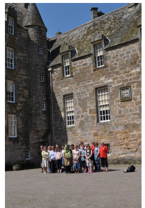
Trustees, volunteers and staff at Kellie Castle for Volunteers Day

To my fellow Trustees many thanks for all of your support throughout the year.